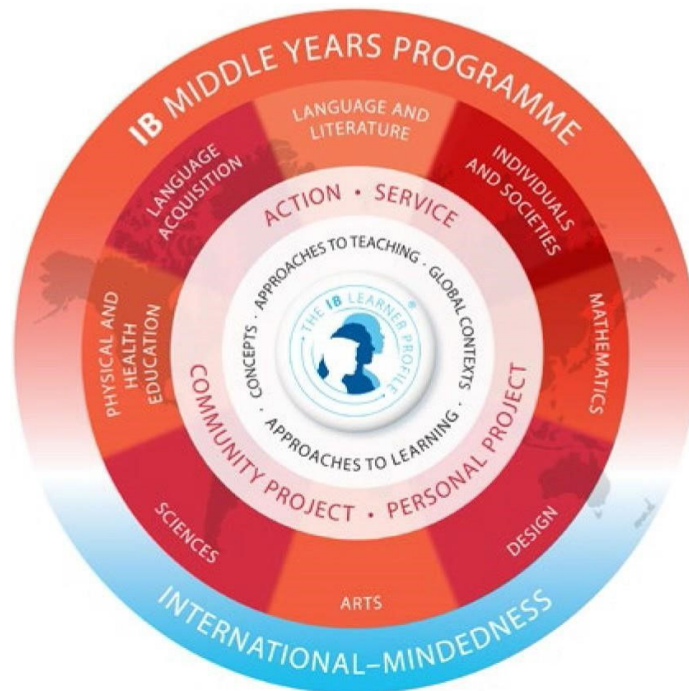
Figure 1: The IB Middle Years Programme curriculum overview

The IB Middle Years Programme (MYP) provides a framework of academic challenge that encourages students to embrace and understand the connections between traditional subjects and the real world and become critical and reflective thinkers.