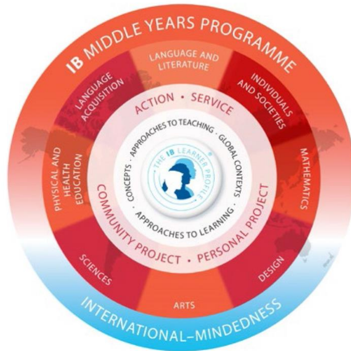
Figure 1: The IB Middle Years Programme curriculum overview

The IB Middle Years Programme (MYP) provides a framework of academic challenge that encourages students to embrace and understand the connections between traditional subjects and the real world, and become critical and reflective thinkers.